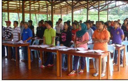
Forest Fire Training (1—3 August 2016)