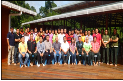
Wildlife Honorary Warden Training (26-28 July 2016)

The company is committed to provide and expose staff to more training, seminars and personal improvement. Among the courses we have sent staff to this year are to Sabah Forestry Institute on Forest Ranger Course, ARGIS Course, Mindset lectures and others.