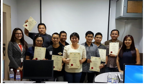
ArcGIS Training (07—09 September 2016)

Congratulation to all the participants for the Tree Identification Course (19—22 May 2016)!